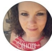
The 3AM Teacher